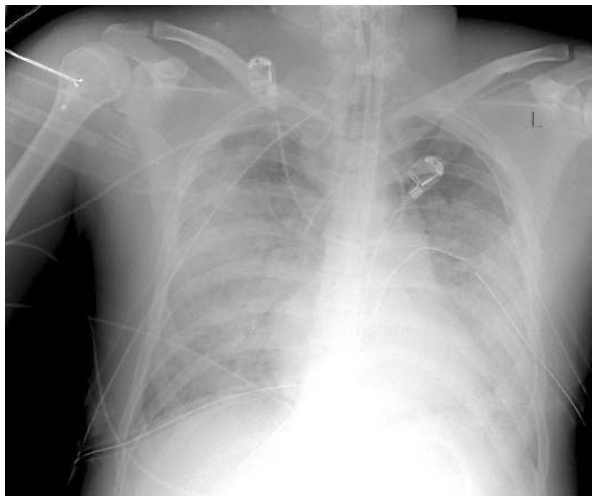
Figure 1: Chest X-ray following explosion trauma: diffuse, widespread opacification, affecting almost all lung areas.